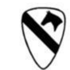
First Cavalry Division